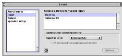
Apple Menu > Control Panels > Sound with Input set to Built-in and External Mic