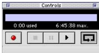
Controls Panel with Loop button depressed